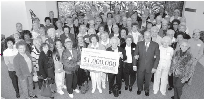
Million Dollar Pledge for Patient Pavilion.