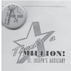
Thanks a Million!

created a Manager of Volunteers position and a Volunteer Services Department to support the Auxiliary and hospital volunteers in general.